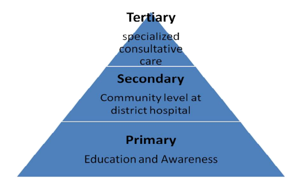
Fig-2: Levels of Health Care System

Vol. 6, Special Issue 11, September 2017