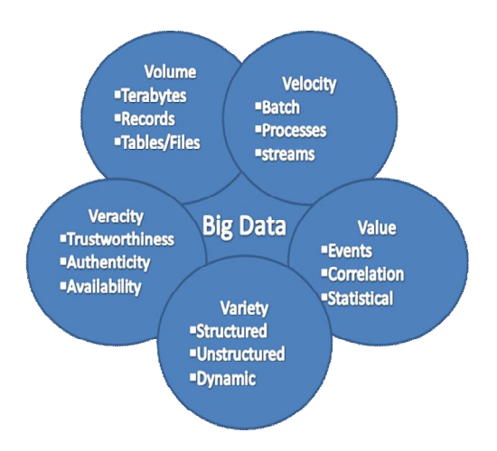
Fig-1: The 5 V's of Big Data

Value: This characteristics is about the quality of data. Generally, EHR's and EMR's are considered as a high value of data. Social media data also has modest value but it is intricate to find out. High value of data leads to better healthcare solution and cost effective. The characteristics are shown in the figure 1.